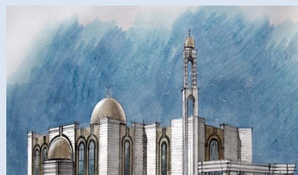
South Nepean Muslim Community (SNMC)

Please Donate ONE Prayer Spot for $2,500 and be the ONE who will build the Masjid and the Center so that it could help us and our children maintain Islamic Identity and build strong Canadian National Identity, Insha Allah.