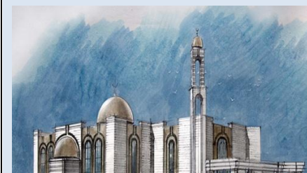
South Nepean Muslim Community (SNMC)

Please Donate ONE Prayer Spot for $2,500 and be the ONE who will build the Masjid and the Center so that it could help us and our children maintain Islamic Identity and build strong Canadian National Identity, Insha Allah.